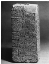
Code of Hammurabi (right) Sumerian King List (below)